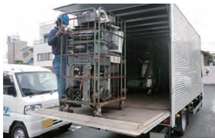
Recycling used gas equipment

The Toho Gas Group has a system to collect used gas equipment and packing materials from customers to ensure efficient resource recycling. In FY2023, we collected 775.6 tonnes of reused equipment and 39.3 tonnes of packing material. In addition, we were able to recycle 3.5 tonnes of plastic containers and packaging and 0.4 tonnes of paper subject to the Act on the Promotion of Sorted Collection and Recycling of Containers and Packaging.