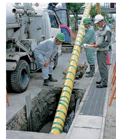
Trenchless pipe installation method

Nearly all asphalt and concrete blocks are recycled as reused asphalt mixture (pavement material). Additionally, used polyethylene pipes are recycled as raw material for protecting gas pipes. As a result, we achieved a recycling rate of 99.6% for industrial waste generated from gas pipeline construction.