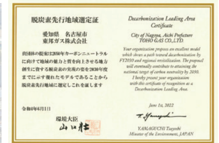
Decarbonization Leading Area Selection Certificate