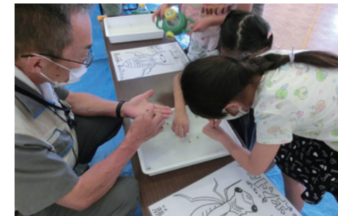
Environmental education class

"Learning Biodiversity through Biotope" and "Observation and Learning at the Exhibition Hall," engaging 343 elementary school students.