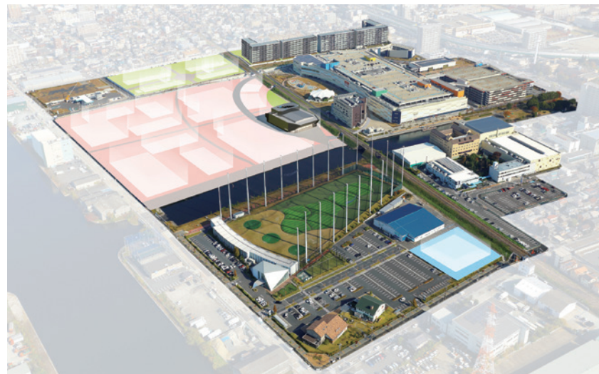
Panoramic view of Minato AQULS