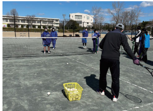
Soft tennis class

We will continue contributing too the community through sports promotion activities.