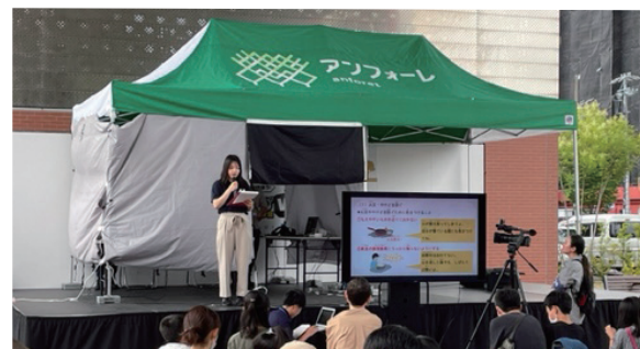
Stage exhibition at an environmental awareness event held by Anjo City (an undertaking based on the comprehensive collaboration agreement)