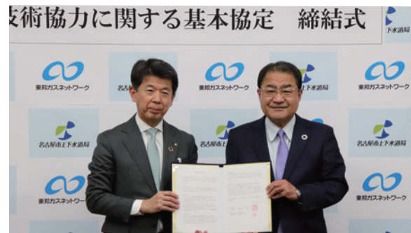
Agreement signing ceremony (March 2023)

Given the common tasks related to maintenance of pipeline equipment and human-resource development, this collaboration aims to resolve issues quickly and enhance the efficiency of business operations through working together and cooperating in information exchange, joint inspections, and