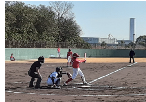
Youth Baseball Tournament

To contribute to local sports promotion and the wholesome development of junior high school students, we have been collaborating with the Japan Boys League to host a boys' baseball tournament since FY1993. In FY2022, 29 teams participated, showcasing heated matches.