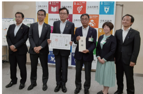
Certificate of appreciation presentation ceremony

We have been working to expand energy-saving "green curtains" since FY2014 by making efforts to control rising temperatures in buildings using plants. In FY2022, we donated 500 bags containing seeds of the goya (bitter melon) and 728 goya (bitter melon) seedlings to the City of Nagoya, which were distributed to citizens at environmental events such as Environment Day Nagoya.