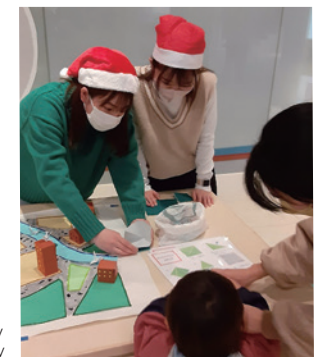
Eco Class held jointly with a local university

We also hold an "Eco Class" every month, where activities include observing creatures in the biotope, creating art using recycled materials, and collaborating with local universities to teach ecosystem conservation through quiz-based sessions.