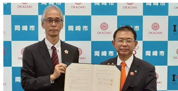
Signing of the comprehensive collaboration agreement with Okazaki

accumulated, we will enhance initiatives that lead to coexistence with local communities through collaboration with municipalities, aiming to achieve a sustainable society.