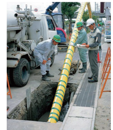
Trenchless pipe installation method

Almost the entire volume of asphalt and concrete lumps is recycled a reclaimed asphalt mixture (pavement material). Used polyethylene pipes are recycled as raw materials for components that secure gas pipes and other uses. As a result, a recycling rate of 99.7% for industrial waste generated from gas pipeline construction has been achieved.