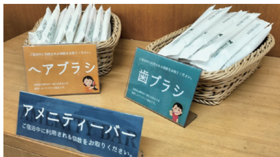
Amenity bar at Howa Seminar Plaza

Toho Real Estate Co., Ltd. had been placing amenities in every room of the Howa Seminar Plaza training facility with accommodation, but has changed to amenity bar style to provide amenities to only those that need them in response to the Act on Promotion of Resource Circulation for Plastics that went into effect in April 2022. Steps have also been taken to reduce plastic use, such as by switching from plastic straws to paper straws at the Cherry bakery cafe at Minato AQUUS.