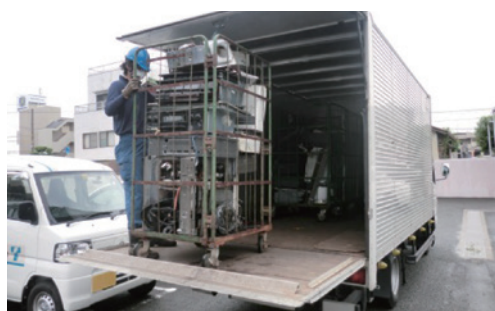
Recycling used gas equipment

The Toho Gas Group has organized a system to collect used gas equipment and packing materials from customers, facilitating efficient resource recycling. In FY2022, this resulted in collection of 1012.7 tonnes of used equipment and 39.7 tonnes of packing material. Results for recycling of resources subject to the Containers and Packaging Recycling Act were 4.2 tonnes of plastic containers and packaging and 0.3 tonnes of paper.