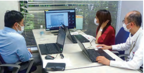
Implementation of independent third party guarantee work

We took on-site surveys on energy usage, waste volume, and water usage, and, from the perspective of environmental load in the value chain, sales volume for city gas, heat, and electric power, energy resource procurement sources, and CO 2 emissions by customers, at major business sites including city gas plants, area heating and cooling facilities, our headquarters, and at affiliated companies with significant environmental loads. This fiscal year, in response to COVID-19, we avoided conducting face-to-face surveys, and instead devised measures such as web meetings to carry out the surveys. In the future, we will continue to work on the enhancement of data reliability and augmented disclosure of the Toho Gas Group's environmental information.