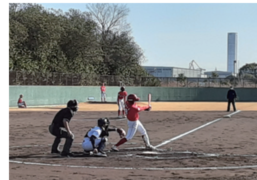
Youth Baseball Tournament

To contribute to local sports promotion and the wholesome development of junior high school students, we have been collaborating with the Japan Boys League to host a boys' baseball tournament since FY1993. In FY2022, 29 teams participated, showcasing heated matches.