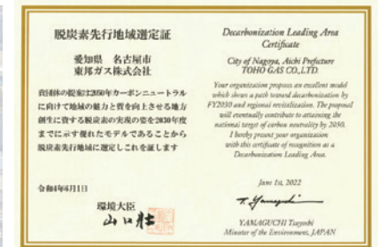
Decarbonization Leading Area Selection Certificate