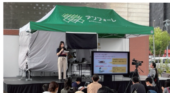
Stage exhibition at an environmental awareness event held by Anjo City (an undertaking based on the comprehensive collaboration agreement)