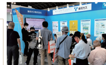
NSE IR Expo (September 2022)

●Results for FY2022 Number of meetings held 7