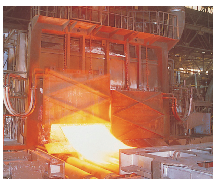
Industrial furnace for industrial use