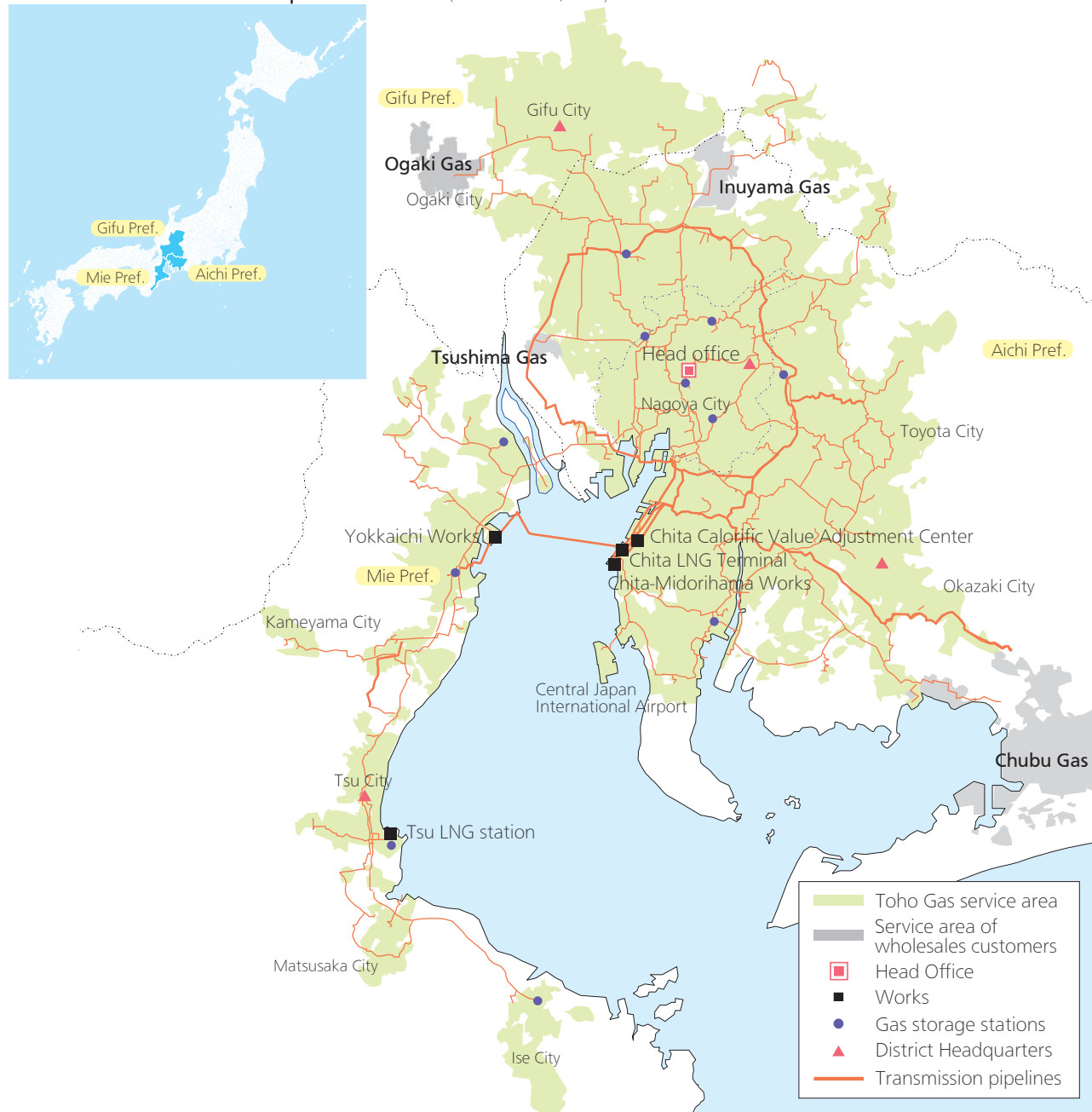
Toho Gas Service Area and Pipeline Network (As of March 31, 2017)