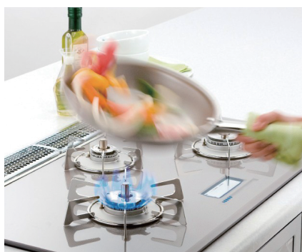
Si sensor gas kitchen stove for residential use