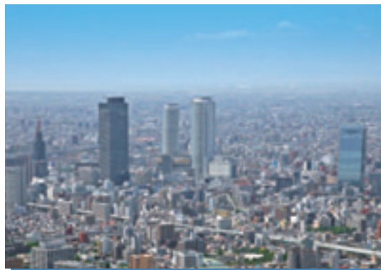
Development in progress around Nagoya Station

*Medical Valley Project: A project whose goal is to create an organic network (industrial cluster) of colleges, research institutes, companies and service providers toward promoting a shift to a competitive industrial structure, thereby resulting in a succession of new businesses and venture companies that further cluster industries together.